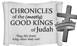
2023 Midweek Lenten Worship Series