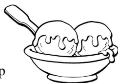
National Ice Cream Day July 18

Today (Sunday) is National Ice Cream Day , and we couldn’t let it go by without enjoying some ice cream together. As they say, “ You can’t buy happiness, but you can buy ice cream and that’s pretty much the same thing. ” After worship, the church council will be in the south fellowship hall serving up bowls of ‘happiness’ with toppings. Let’s call it our National Ice Cream Day Java Joy . Please come on down and have a bowl, and enjoy one another’s company. Remember to sanitize your hands when handling toppings or anything else others may touch.