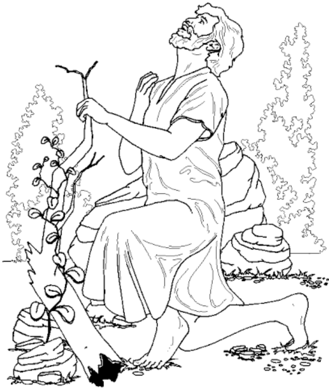
Jesus prayed in the garden of Gethsemane.