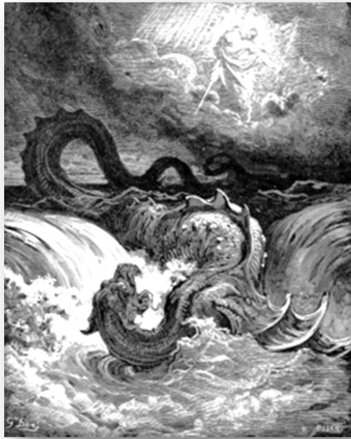
The Destruction of Leviathon Gustave Doré (1865)